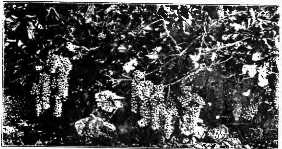
The Thompson Seedless grape was first grown in Sutter County

Excellent prices are received for both the seedless raisins and green grapes. An acre of Thompson vines produces from five to ten tons of green grapes. Many varieties of table and wine grapes, including the well-known Zante currants, are grown in this county.